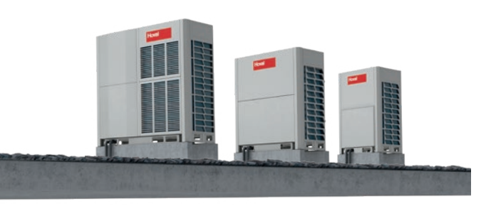
Hoval Belaria® VRF (33, 40, 67): Modulating heat pumps in 3 output sizes allow the indoor climate system to be optimally adjusted.