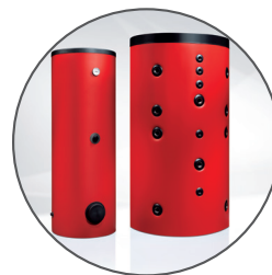
Hoval storage tanks