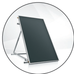
Hoval solar plants