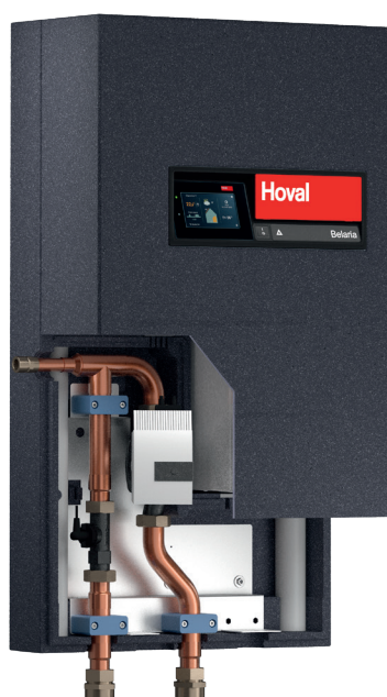
Belaria® pro (24)