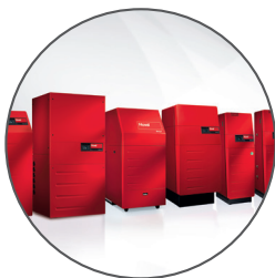
Hoval heat generators

This solution ensures you are provided with standardised operation and matching components.