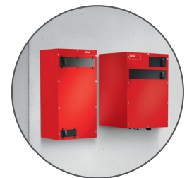
Hoval comfort ventilation